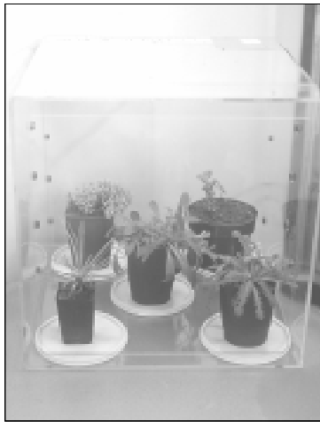
Host specificity test set up used for the hieracium gall wasp the abundance of agents and their host plants.

The first question on many peoples' lips when they hear about biological control agents being released is "What are they going to eat next?" To some people biological control sounds frightening and dangerous. They fear massive ecological damage, and often our work is directly compared with the introduction of rabbits or ferrets. This comparison could not be further from the truth. Safety issues are also foremost in the minds of biological control of weeds researchers, and only specialist feeders are considered. These specialists have co-evolved with their host plants over a long period of time, and have developed adaptations that allow them to find and feed on that host plant, and sometimes close relatives of that plant. This specialisation makes it difficult for them to change host, and the chance of this happening has been calculated at between one in ten million, and one in one-hundred million (the risk of native species unexpectedly becoming a problem is the same). Biological control agents will also never run out of food because they are unable to eradicate their host plants — this is because they can never find or utilise every plant. If biological control is successful, plants become increasingly rare and the agent populations reduce accordingly, so a new equilibrium forms between