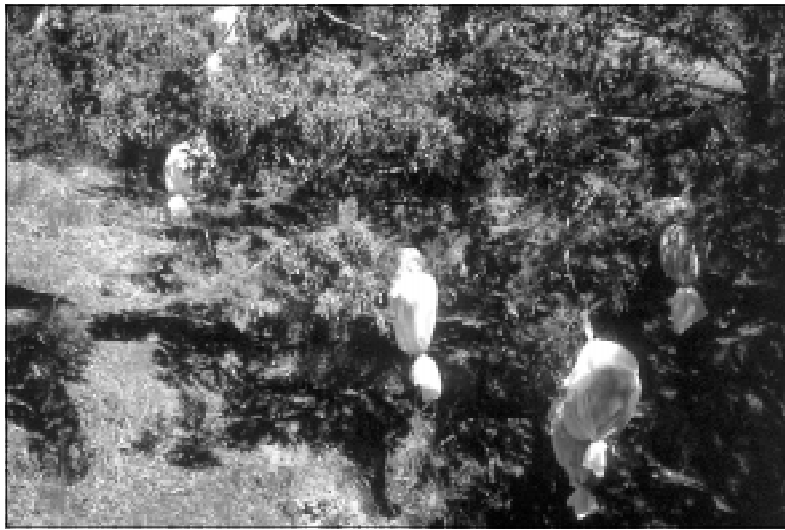
Collecting seed-feeding wasps from silver wattle using sleeve cages

Water is one of South Africa's most precious commodities. Invasive pines and Australian wattles (now called Racosperma in New Zealand, but previously known as Acacia ) are seriously threatening that resource by sucking rivers dry, displacing native vegetation, increasing the risk of fire, and interfering with agriculture. The South African government has started a "Working for Water" programme, which aims to reduce the exotic tree cover in key areas. It is a huge, expensive undertaking. The plants are physically cleared but, with so much seed in the ground, this is only a temporary solution. A more permanent solution, incorporating biological control, is required and New Zealand is playing a small part in trying to help.