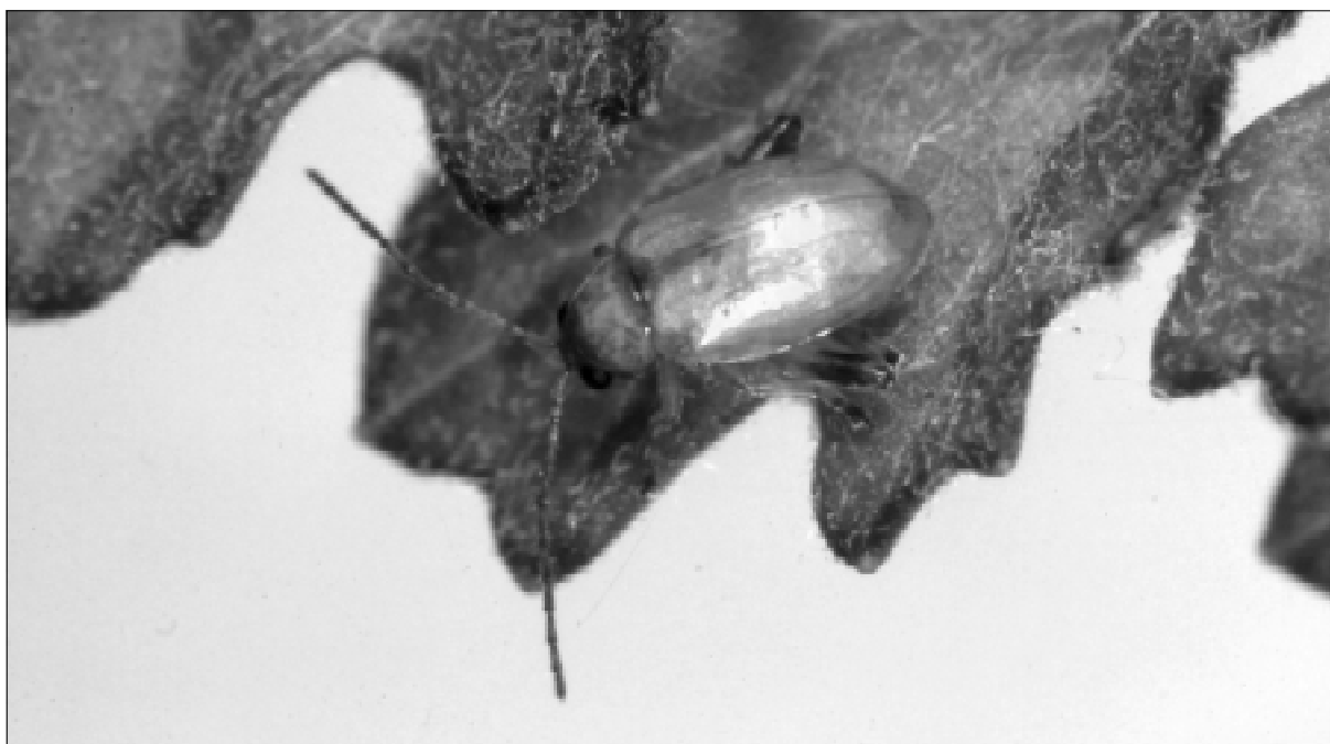
Ragwort flea beetle

Answer: Dispersal seem to be highly variable. We've had reports of ragwort flea beetles being recovered several kilometres away from a release site in the first season, but these might have been