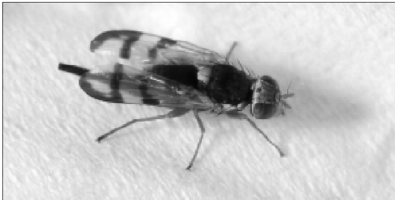
Scotch thistle gall fly

The Scotch thistle gall fly ( Urophora stylata ) was released for the first time on two farms in Auckland's Rodney District just before Christmas. This project was also made possible by a cash injection from AGMARDT and some funding from the Wool Board. We imported the flies from Australia as larvae inside infested flowerheads and the new adults emerged inside our quarantine facility at Lincoln.