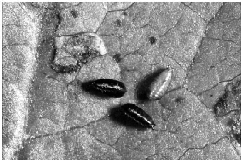
Old man's beard leaf miner pupae

sites. Collect blackened, infected leaves and wash the spores off by swilling them around in a bucket of water. Transfer the resulting liquid into a sprayer (it is better to keep one especially for this purpose to avoid contamination with herbicides etc.) and apply it to some old man's beard foliage. It is preferable to soak one area thoroughly than to apply the mixture too thinly. Because the