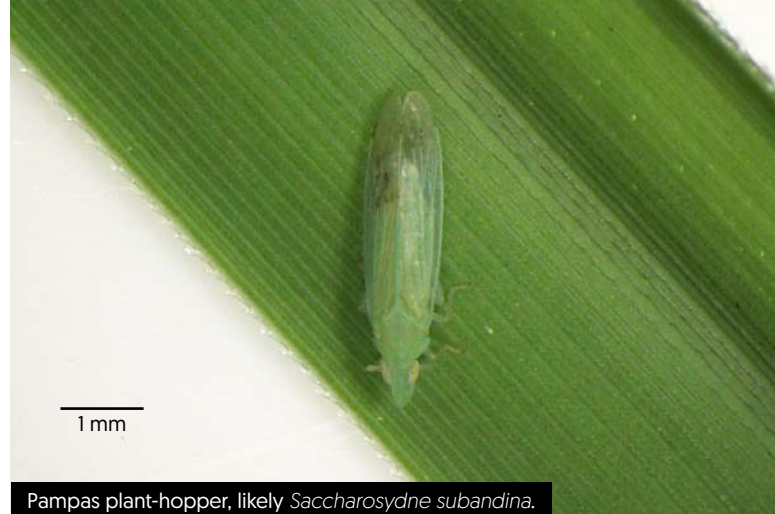
Pampas plant-hopper, likely Saccharosydne subandina .

Meanwhile, work to discover the secrets of a black smut fungus [ Ustilago quitensis ] has also been continuing. This fungus attacks the flowerheads and could potentially reduce the ability of pampas plants to produce seed, but the infection process is poorly understood. Chantal Probst has been working with fungal material, also from Chile, trying a range of inoculation techniques. This work is complicated by the length of time that can elapse between infection and the emergence of infected floral plumes [months or even years later], and the logistics of growing on and then housing large flowering-age plants in a containment facility, let alone getting them to flower on demand.