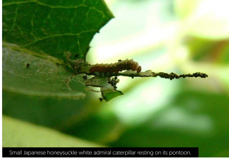
Small Japanese honeysuckle white admiral caterpillar resting on its pontoon.

frass. Don't get confused by larvae of the blue stem borer ( Patagoniodes farinaria ), which look similar to plume moth larvae until they develop their distinctive bluish coloration.