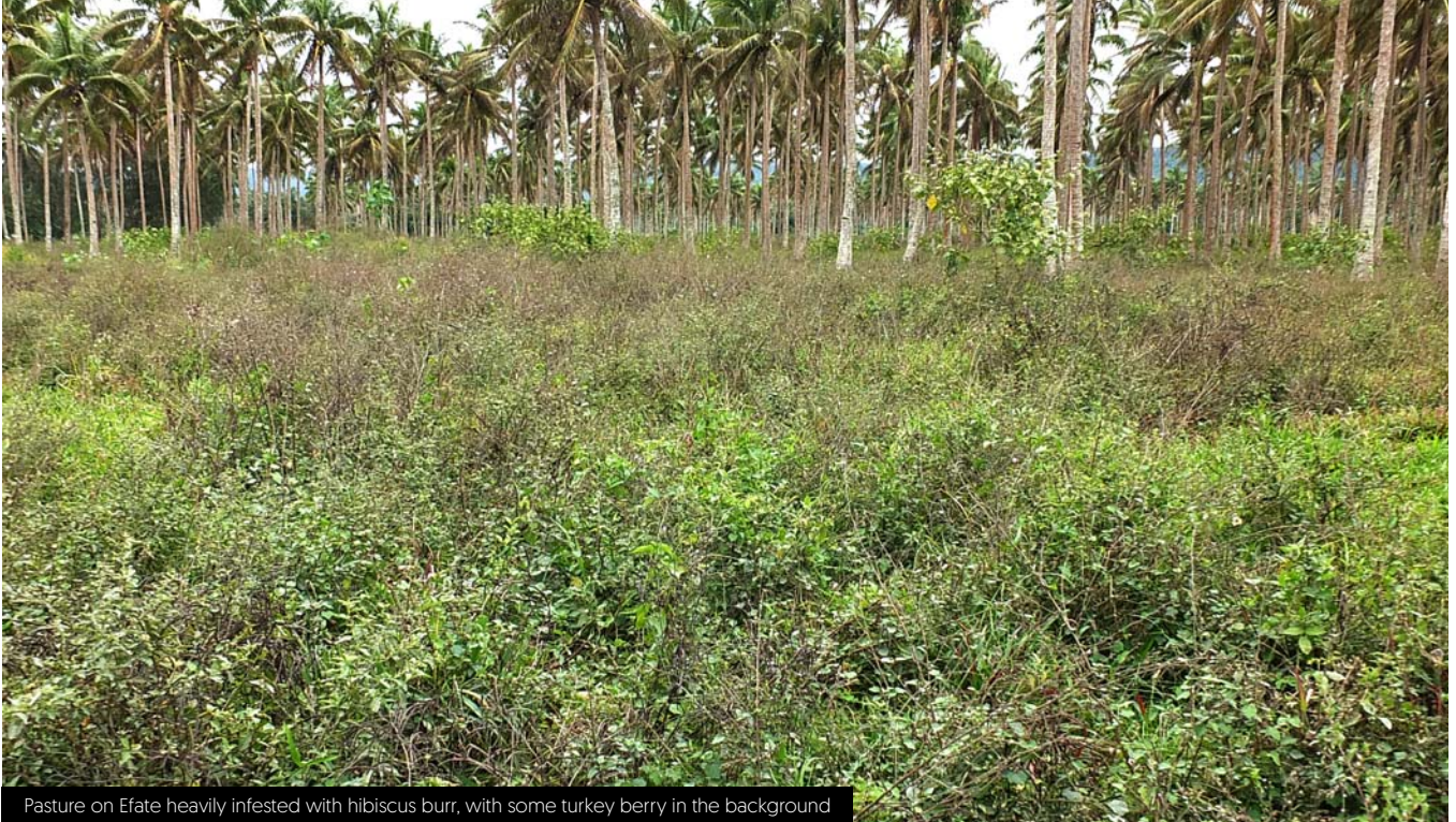
Pasture on Efate heavily infested with hibiscus burr, with some turkey berry in the background