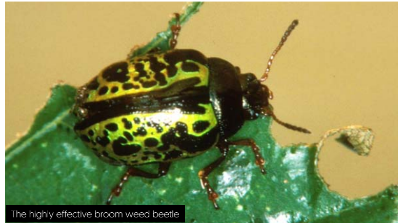
The highly effective broom weed beetle

N. eichhorniae ], and water lettuce [ Pistia stratiotes ] by a third weevil [ Neohydronomus affinis ], has also been fairly good in most areas. Anecdotal evidence suggests that a rust [ Puccinia spegazzinii ] is having an impact on mile-a-minute [ Mikania micrantha ], and a moth [ Epiblema strenuana ] has also reduced the threat posed by parthenium [ Parthenium hysterophorus ]. However, there is considerable potential to build on these good foundations, and an ambitious new 5-year project, which began in July 2018, is aiming to do just that.