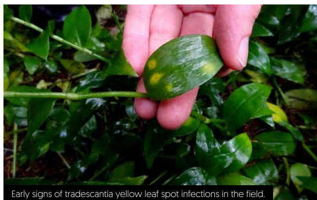
Early signs of tradescantia yellow leaf spot infections in the field.