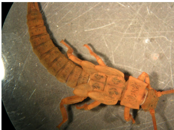
Figure 3: The stonefly Austroperla cyrene coated in iron hydroxide precipitate.

Iron precipitate is caused when large amounts of iron form an orange coating over the streambed and cover algae and insects (Figure 3).