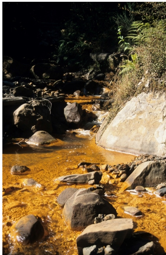
A stream near Reefton with low pH (approx 3.5) and iron hydroxide precipitate. This stream had <4 stream invertebrate species present.

Streams with neutral pH and very low metal content should support a full range and abundance of aquatic life. However, if mining activities cause turbidity and sedimentation then stream life could still be affected by these additions to the stream.